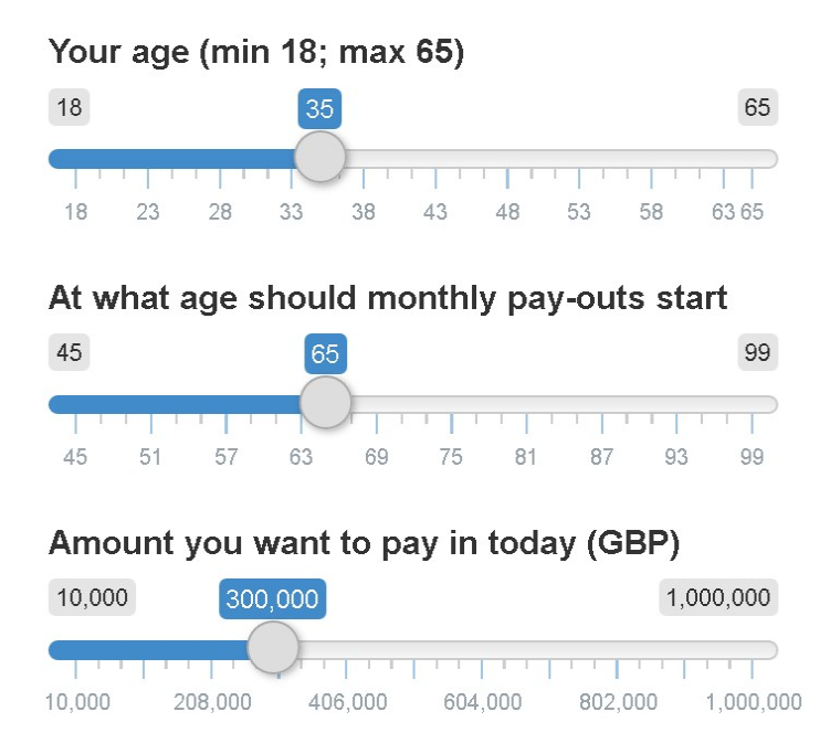
Figure 1: The customer pre-specifies some points for the pension product. The age is used to determine the mortality rate.

Figure 2a shows the slider Emma can use in order to see the trade-off between the length of guarantee and monthly benefit size. All amounts are in real terms, i.e., in today's values, subject to future increases with inflation. This facilitates communication as the amount can be compared with today's purchasing power. Emma can choose between no guarantee, mimicking a classical financial product or a life-long guarantee, mimicking a deferred annuity and hence no exposure to risk. The accompanying percentage states the chance of ending up with the worst-case scenario of hitting rock bottom zero pension once the guaranteed pension income period is over.