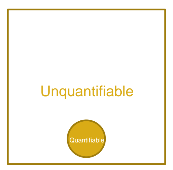
Not a modelling challenge