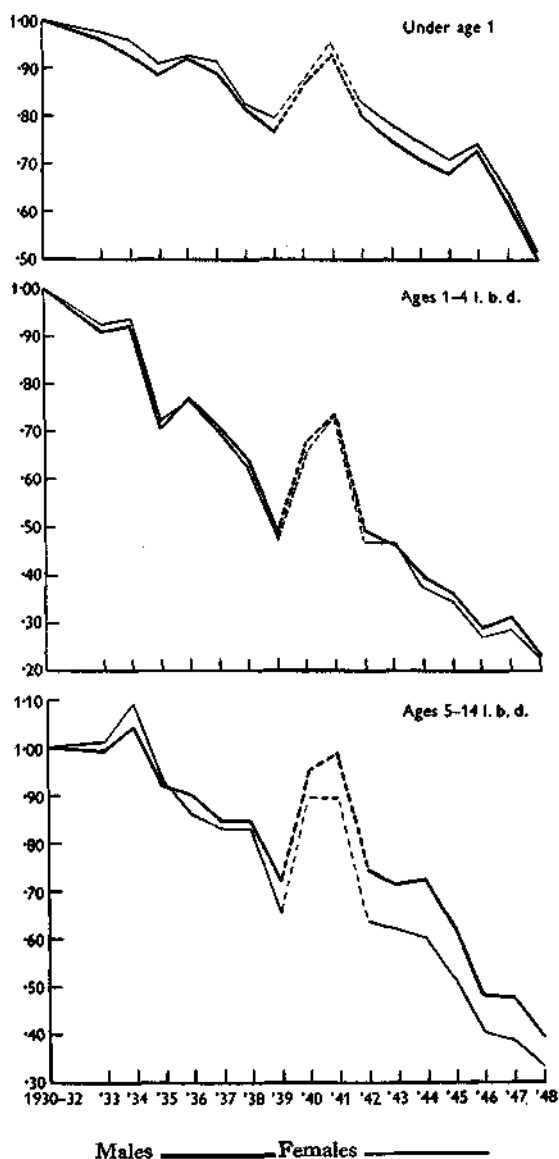
Ratios of group death-rates (standardized) to 1930-32 rates

Ratios markedly affected by war conditions have been joined together by broken lines.